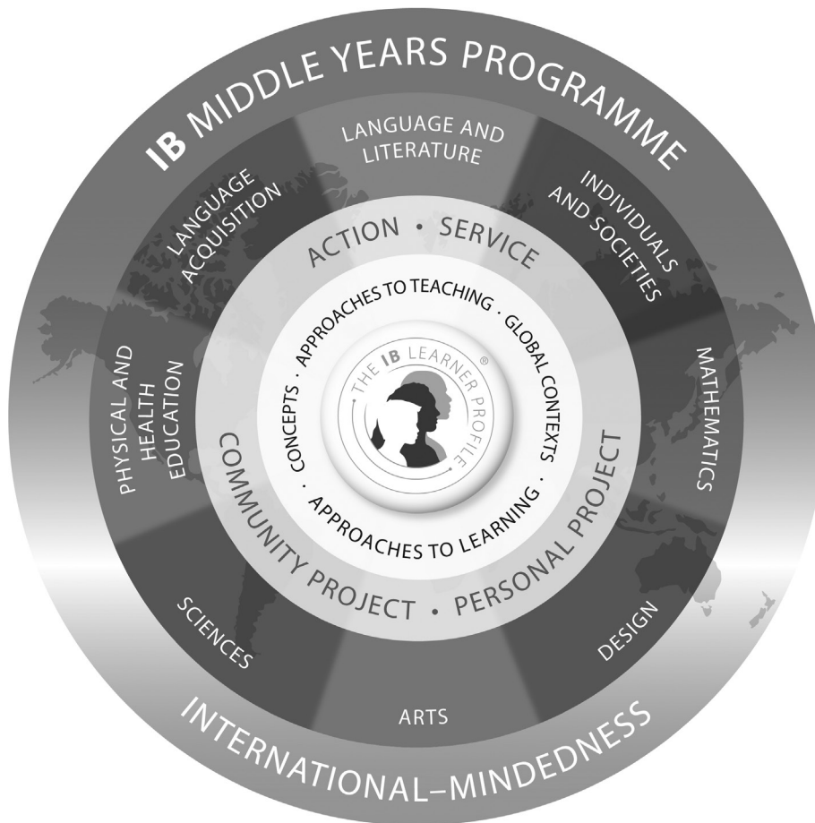
Figure 1 Middle Years Programme Model

The MYP is designed for students aged 11 to 16. It provides a framework of learning that encourages students to become creative, critical and reflective thinkers. The MYP emphasizes intellectual challenge, encouraging students to make connections between their studies in traditional subjects and the real world. It fosters the development of skills for communication, intercultural understanding and global engagement—essential qualities for young people who are becoming global leaders.